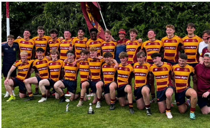
Westcliff Colts XV

U15 League 1 - Eton Manor RFC U15 League 2 - Woodford RFC U15 League 3 – Wanstead RFC U16 League 1 – Eton Manor RFC U16 League 2 - Rochford RFC U16 League 3 – Bancroft RFC Colts League 1 - Westcliff RFC Colts League 2 - Maldon RFC