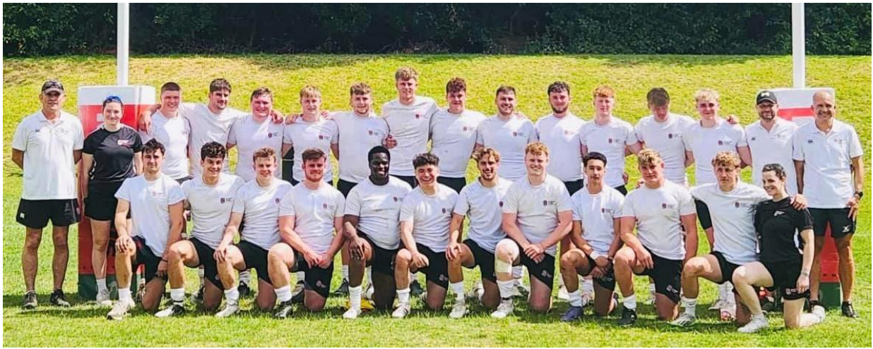
London and SE Divisional U20 Squad