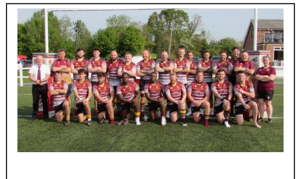
Essex Men vs Bucks