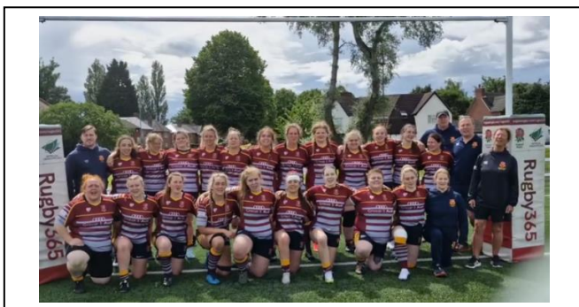
Essex Ladies Vs Staffordshire