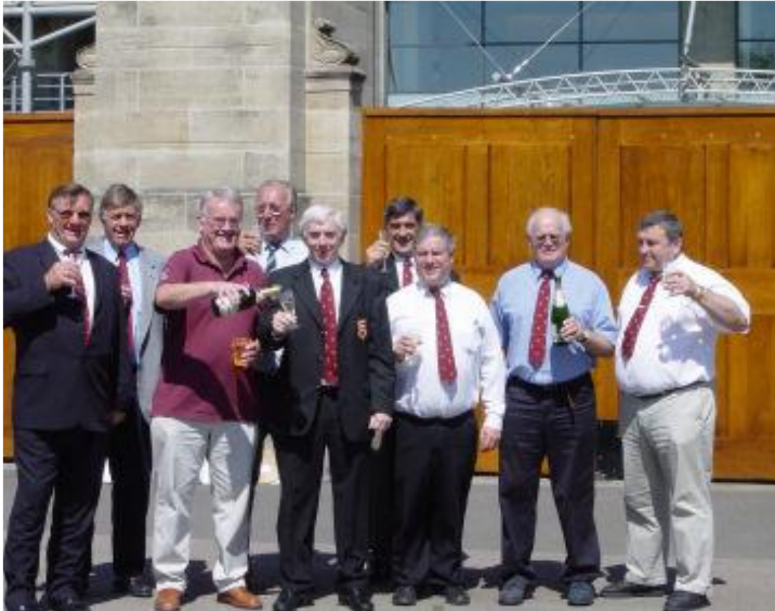
Figure 1 - July 3rd 2003

"The past year has been a momentous season for Essex Rugby. Since achieving our long term aim of Constituent Body status last July, the County has made great strides. We have been faced with great challenges which have been met head on and, whilst on a steep learning curve, we can be proud of the progress that has been made, both with increased administration and our successes where it matters - on the playing field."